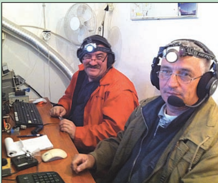
E70T and E70R after night Beverage installation at E77DX.