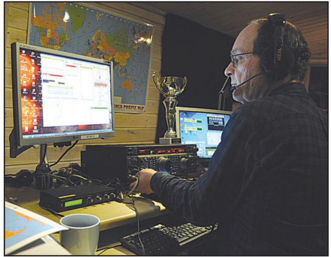
OZ/K3ZJ guest op'd at OZ5E/OZ1ADL for the 160 SSB contest weekend.